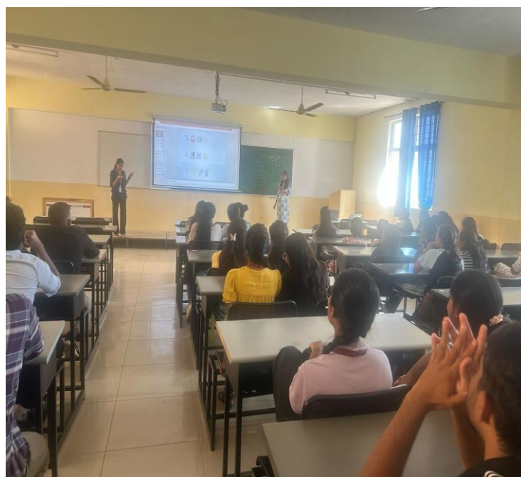
Students participating in the event